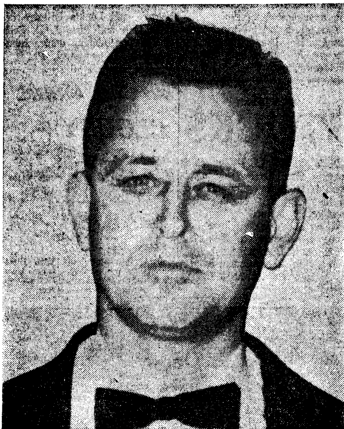
JAMES EARL RAY , also known as Eric Starvo Galt, Harvey Lowmyer, John Willard, James McBride, James Walton, W. C. Herron and James O'Conner.

James Earl Ray, a Missouri prison escapee, sought under the alias Eric Starvo Galt in connection with the gunshot slaying of civil rights leader Dr. Martin Luther King, Jr., is one of the FBI's "Ten Most Wanted Fugitives." FBI Director J. Edgar Hoover ordered the special addition of Ray to the "Top Ten" list to insure widespread dissemination of Ray's photograph and description to speed his location.