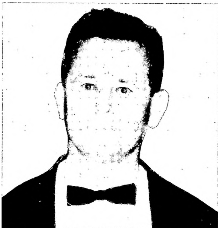
Photograph taken 1968 (eyes drawn by artist)