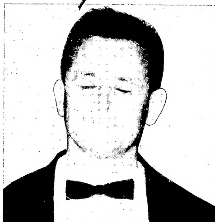
Photograph taken 1968