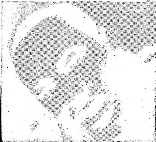
DR. MARTIN LUTHER KING

"Forty million persons perish on an isle of poverty in the midst of an ocean of prosperity. The Negro finds himself in the midst of a major depression.