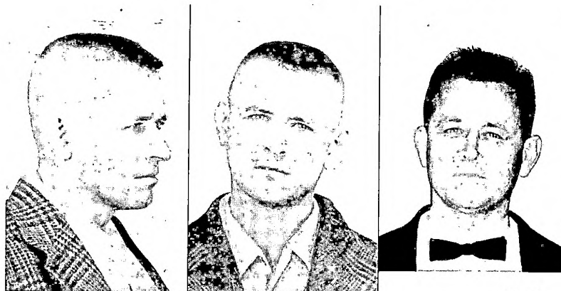
Photograph taken 1968 (eyes drawn by artist)