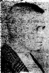
RAY (1960 Photo)

SUBJECT of a world-wide manhunt, James Earl Ray is 40 years old, about five feet, 10 inches tall and weighs between 163 and 174 pounds.