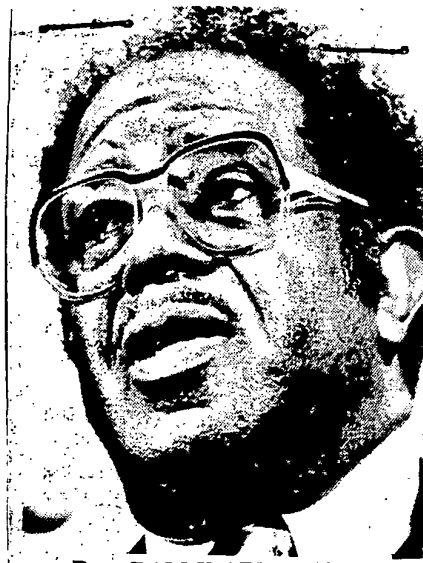
Rev. RALPH ABERNATHY ...Dr. King's associate