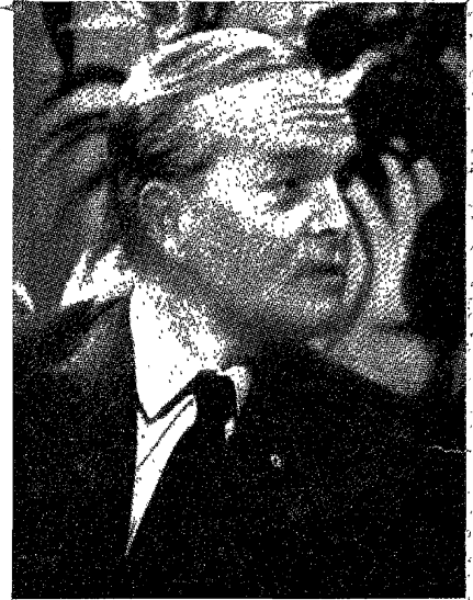
CAPOTE ON "TONIGHT" SHOW Were there two Eric Starvo Galts?

On the rare occasions when writer Truman Capote agrees to submit to a television interview, it is usually because he has something that he wants to say. Last week, when he appeared (for the first time) on Johnny Carson's Tonight show, he wasted little time in