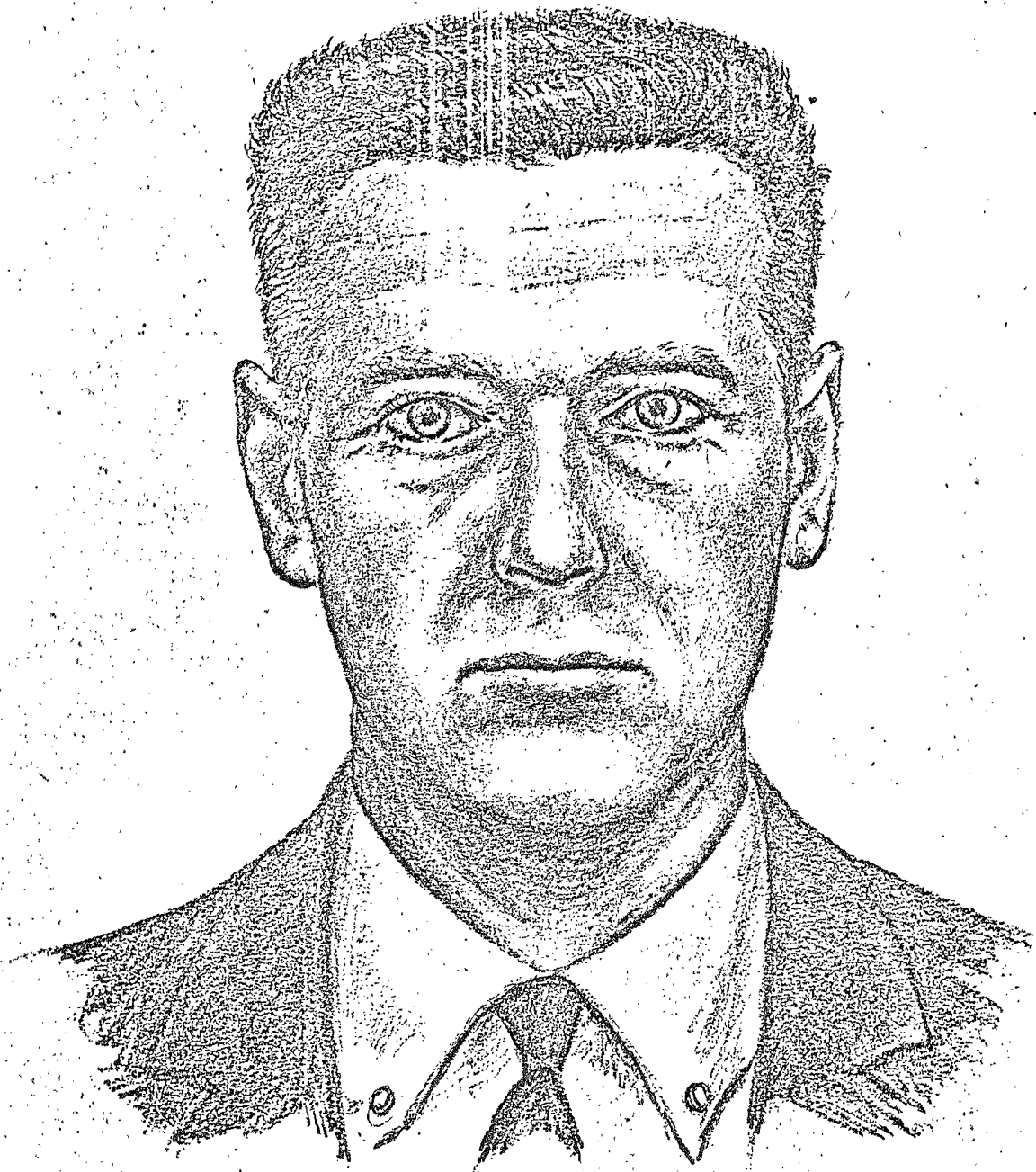
ARTIST'S SKETCH OF UNSUB.