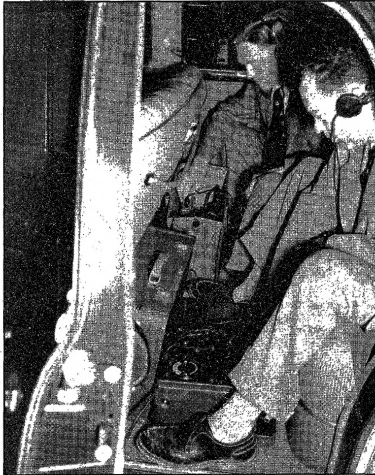
Army Intelligence agents conduct radio surveillance in 1968. Surveillance was conducted in Memphis the day King was killed.

"At one point, we even considered pulling troops out of Vietnam or withdrawing units from