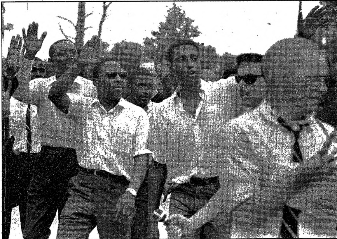
Floyd McKissick (left) of the Congress of Racial Equality, King and Stokely Carmichael take up James Meredith's march on U.S. 51 near Hernando, Miss., on June 7, 1966, the day after Meredith was wounded by gunfire. Meredith was the first black admitted to Ole Miss.