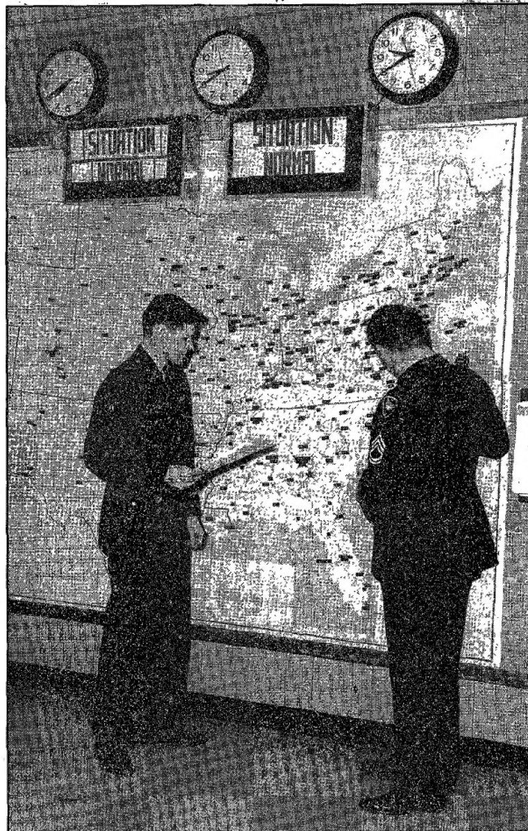
All Army Intelligence operations in the continental United States were coordinated out of the U.S. Army Intelligence Command operations room at Fort Holabird, Md., pictured here in 1968.