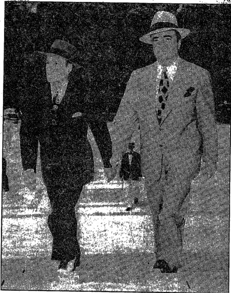
FBI Director J. Edgar Hoover (right) and longtime aide Clyde A. Tolson arrive at the Supreme Court in July 1942.

But Hoover and Van Deman, often through Tolson, regularly shared information on their dual obsessions — Negro and Communist agitators. Hoover continued to share information with the Army's intelligence branch long after Van Deman's retirement.