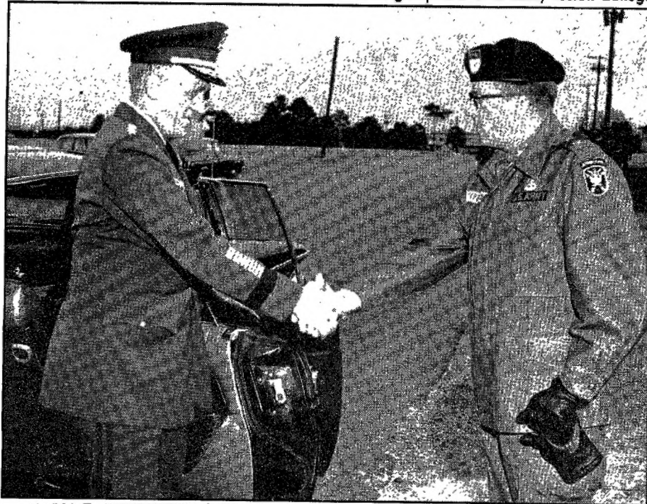
Maj. Gen. William P. Yarborough (right) greets Gen. Harold Johnson outside the John F. Kennedy Special Warfare School at Fort Bragg, N.C. Johnson later would be Army chief of staff and Yarborough his assistant chief of staff for intelligence.