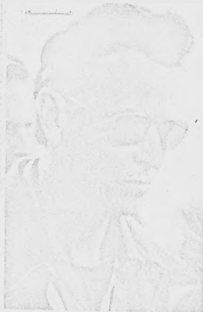
JAMES EARL RAY On way to court