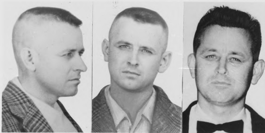
JAMES EARL RAY FBI No. 405,942 G