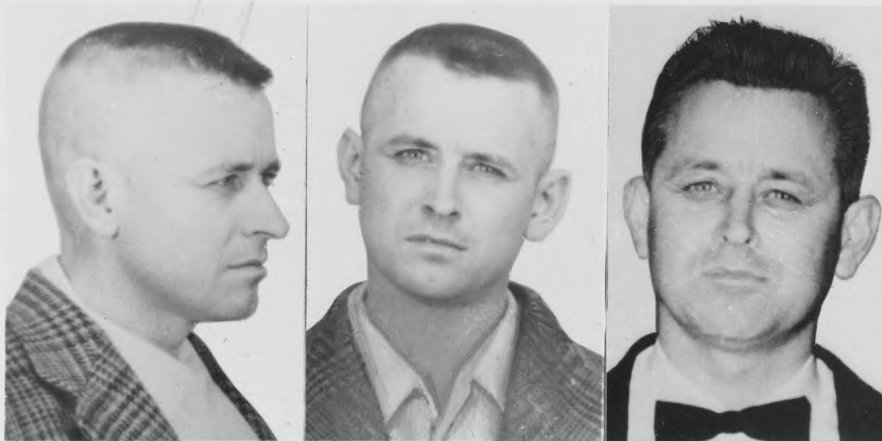
JAMES EARL RAY— FBI No. 405,942 G