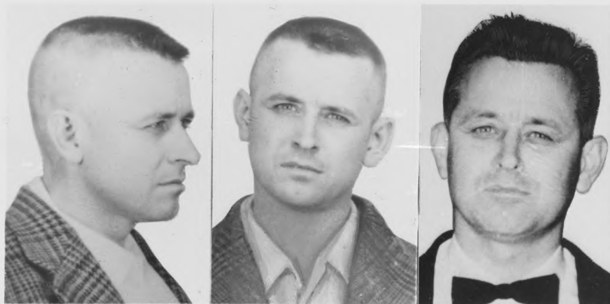
JAMES EARL RAY FBI No. 405,942 G