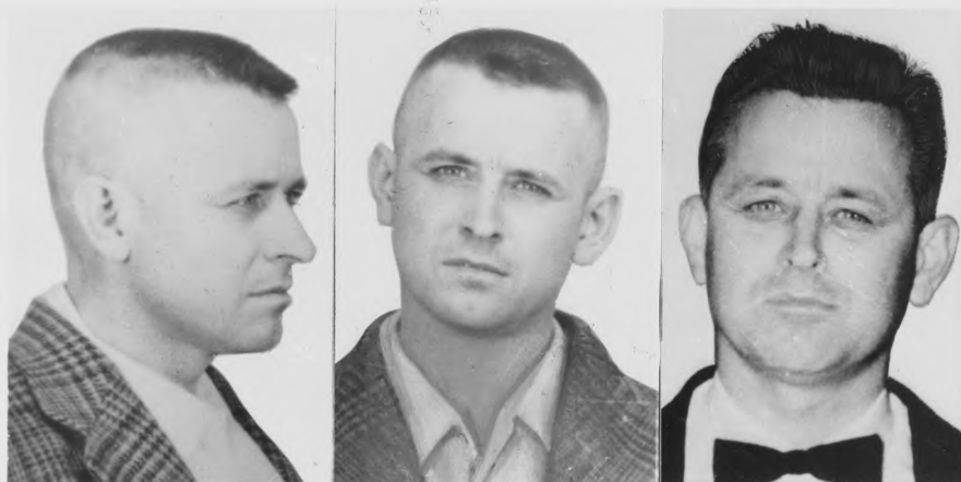
JAMES EARL RAY FBI No. 405,942 G