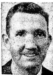
Atty. Gen. Ramsey Clark

after King was shot, and freely answered most inquiries from reporters. Since then, he