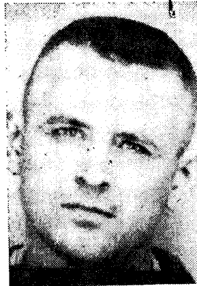
James Earl Ray, who has been identified by the federal bureau of investigation as the Eric Starvo Galt wanted in the assassination of the Rev. Martin Luther King, jr., was photographed when sentenced to prison (left) on Dec. 17, 1959; and in a Missouri prison in 1960 (right).