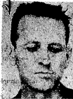
James Earl Ray

Washington, D. C. —UPI— No. 9 on the FBI's list of 10 most wanted men has yet to be caught, but justice department officials insist that the search for James Earl Ray is just as intense as ever.