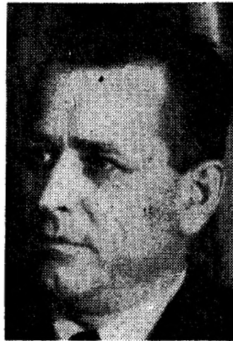
JAMES EARL RAY

He will be sent home under heavy guard, probably on a