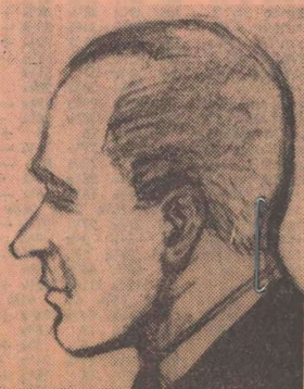
Sketch of Galt