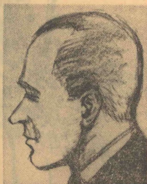
A Memphis newspaper artist made this sketch from a description of the slaying suspect by a man who saw him at hotel.

The pickup notice added further mystery to the FBI's intensive but secrecy-wrapped hunt for the assassin who shot the civil rights