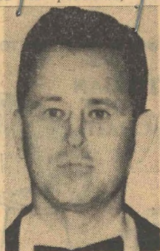
Eric Starvo Galt