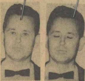
FBI's GALT PHOTOS

The state charge of first-degree murder was filed against Galt in Memphis