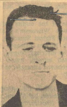
James Earl Ray ... 1966 photo

Galt seemingly was a tree spender. Aside from the dancing lessons, which cost