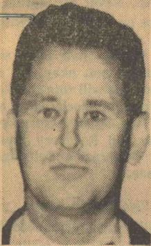
Eric Starvo Galt ... eyes painted in