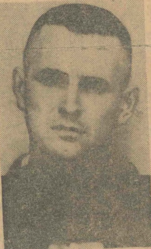
SAME MAN IN 1960 ... used Galt as alias