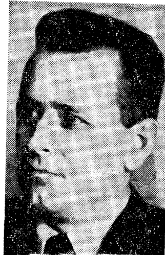
Ray in California

him wearing sun glasses and what appears to be a white sports shirt. The FBI said Ray is known to wear sun glasses frequently.