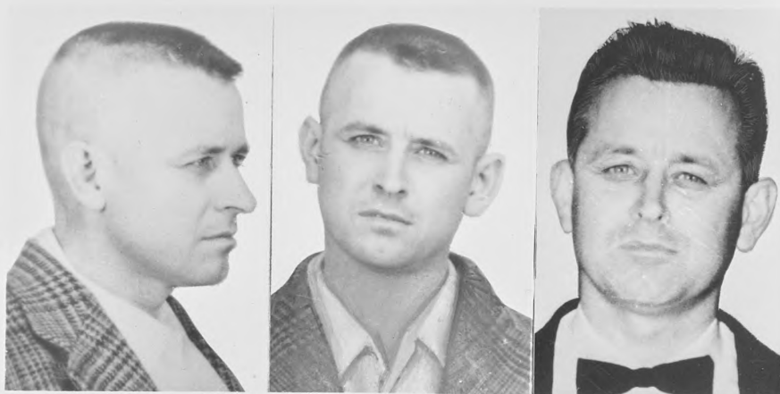
JAMES EARL RAY FBI No. 405,942 G