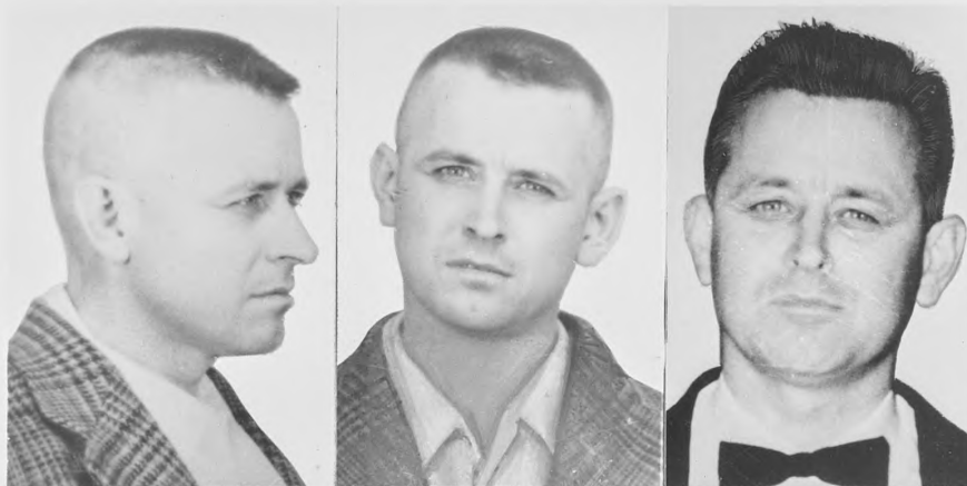
JAMES EARL RAY FBI No. 405,942 G