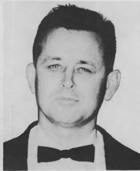
Fotografías tomada en 1960