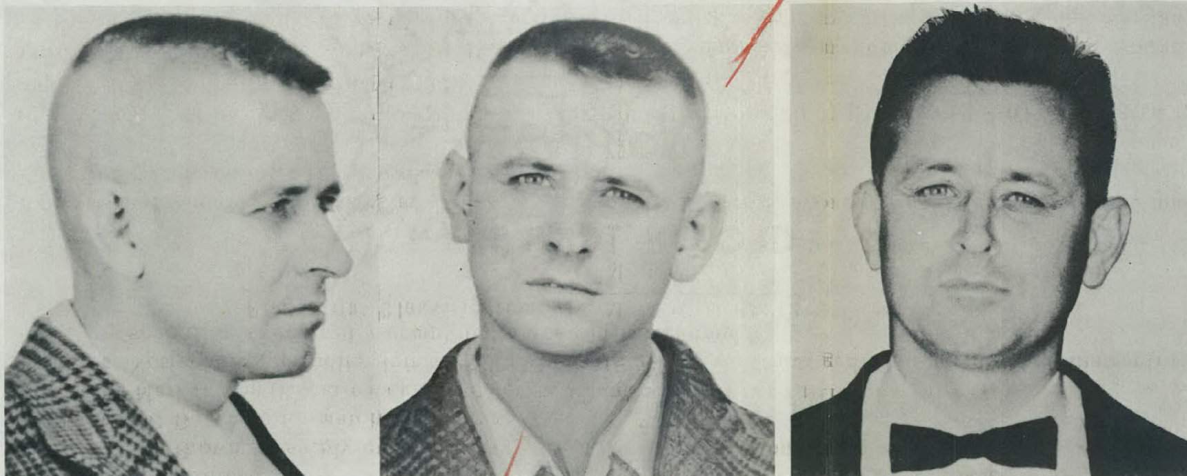
Photographs taken 1960