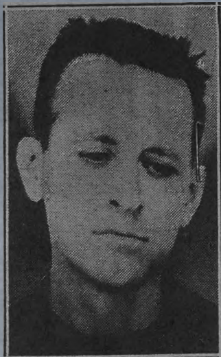
James Earl Ray A million-dollar killer?