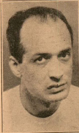
Jerry Ray

Chicago, May 2 (AP)—Jerry Ray, whose brother, James, is sought in the murder of Dr. Mar-