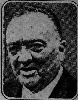
J. Edgar Hoover

(Indicate page, name of newspaper, city and state.)