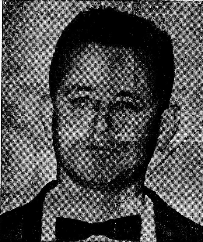
JAMES EARL RAY, also known as Eric Starvo Galt, Harvey Lowmyer, John Willard, James McBride, James Walton, W. C. Herron and James O'Conner.

James Earl Ray, a Missouri prison escapee, sought under the alias Eric Starvo Galt in connection with the gunshot slaying of civil rights leader Dr. Martin Luther King, Jr., is one of the FBI's "Ten Most Wanted Fugitives." FBI Director J. Edgar Hoover ordered the special addition of Ray to the "Top Ten" list to insure widespread dissemination of Ray's photograph and description to speed his location.