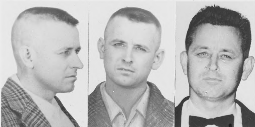
JAMES EARL RAY FBI No. 405,942 G