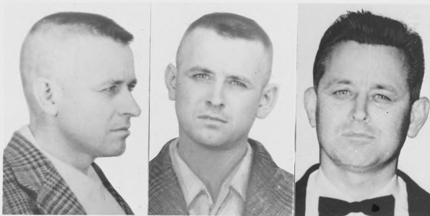
JAMES EARL RAY FBI No. 405,942 G