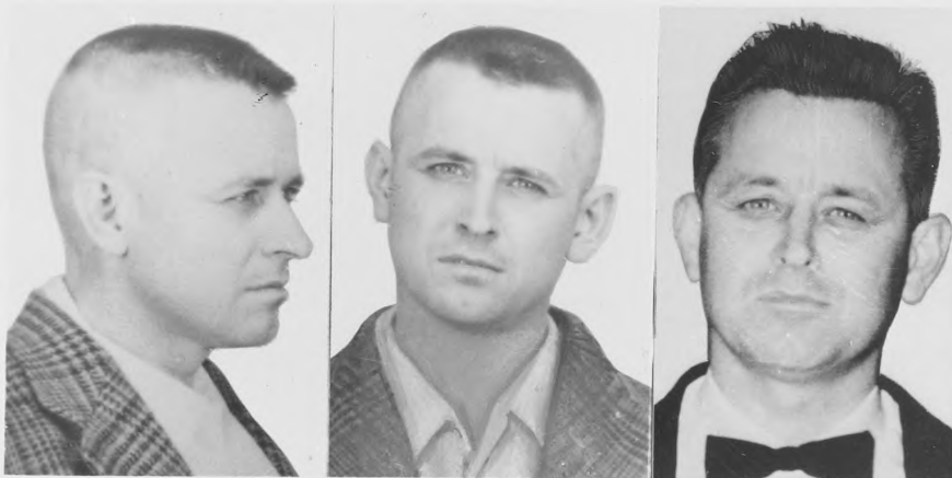
JAMES EARL RAY FBI No. 405,942 G