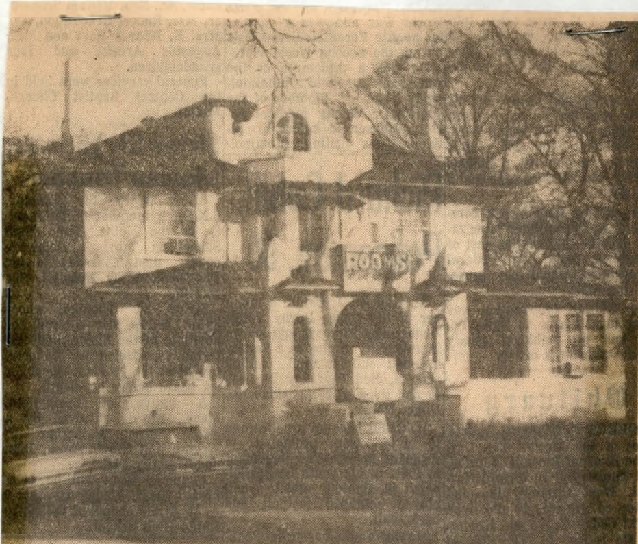
This is the Birmingham, Ala., rooming house that was the last known address of Eric S. Galt, whose car, a white Mustang, was found in Atlanta, Ga., and seized. The assassin of Dr. Martin Luther King, Jr., escaped in a white Mustang.