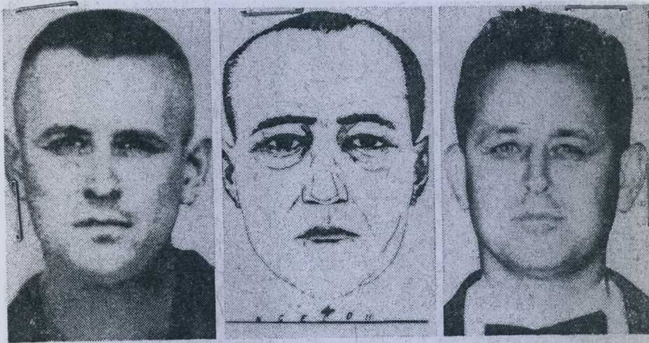
Photos of James Earl Ray, suspect in slaying of Dr. Martin Luther King, Jr., flank a State police composite drawing of a murder victim found buried near Mahanoy City, Pa. Slim possibility that the body may be that of Ray is being investigated by State and local officials and agents of the FBI.