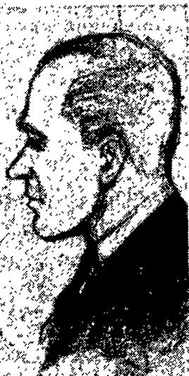
Drawing of Killer Based on Descriptions

"He was wearing a black-solid color—dress suit, a white shirt and a very dark or black, narrow tie. He combed his hair straight back."