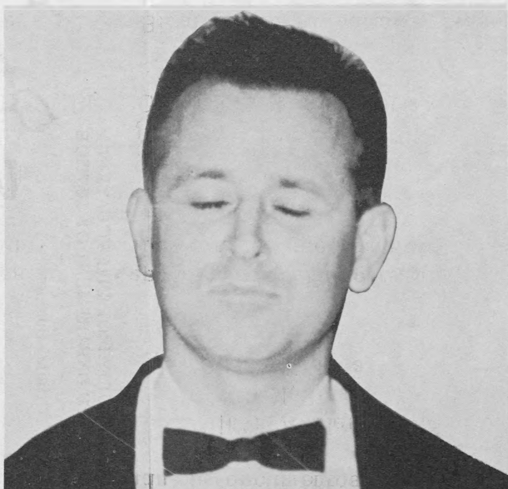
Fotografía tomada en 1968

También conocido por: Harvey Lowmyer, John Willard