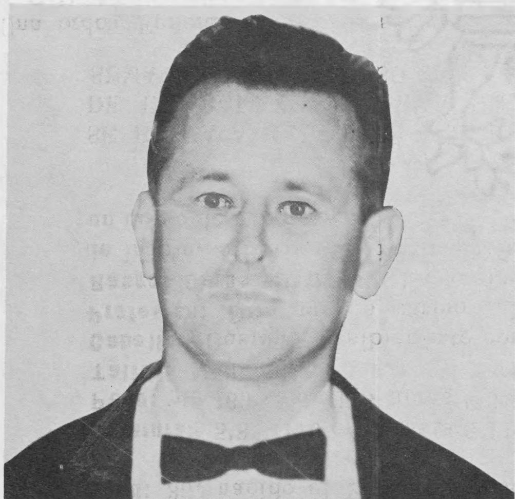
Fotografía tomada en 1968 (Los ojos son dibujados por un artista.)