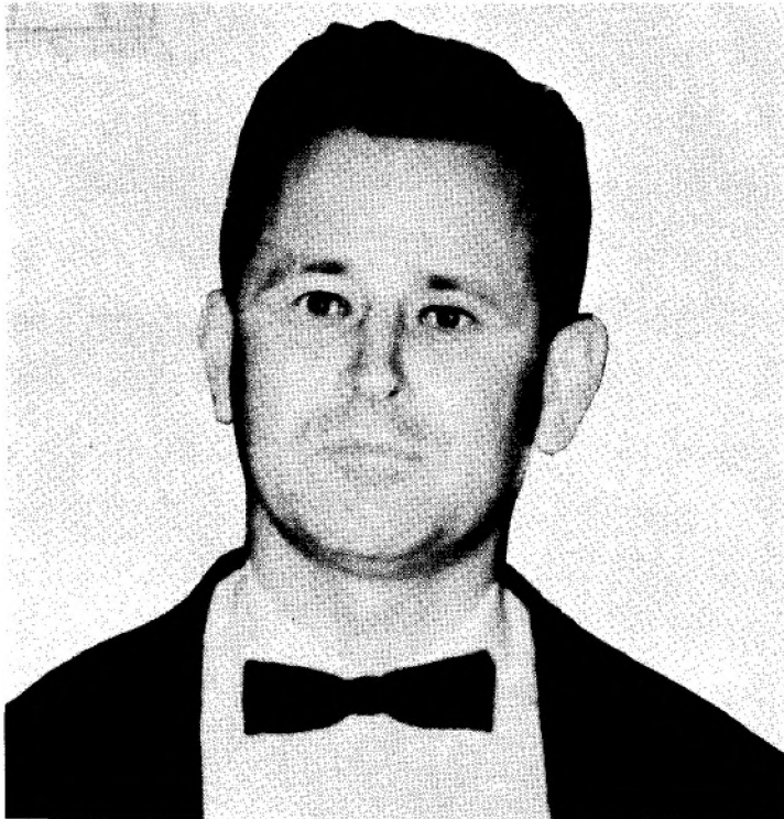
Photograph taken 1968 (eyes drawn by artist)