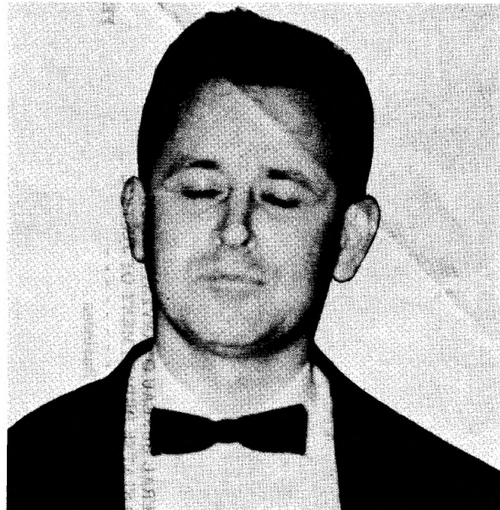
Photograph taken 1968