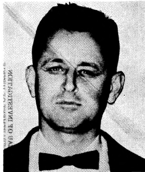
Photographs taken 1960