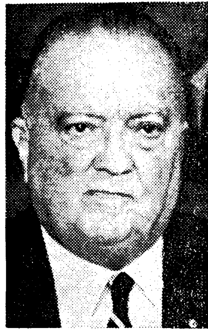
J. EDGAR HOOVER