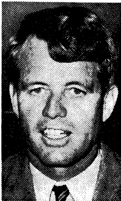
ROBERT F. KENNEDY