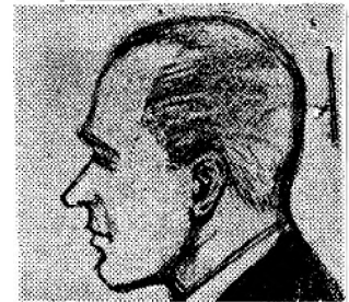
This composite sketch of a man seen running from the flophouse from which the fatal bullet was fired was made by a Memphis Commercial-Appeal staff artist. Galt, he said he remembered picking up the man.

One cab driver said the FBI asked him if he'd picked up any fares at the Playroom April 5, and, when shown a sketch of