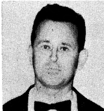
Photograph taken 1968 (eyes drawn by artist)