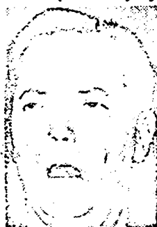
DA GARRISON His life may be in danger.

In an Associated Press story that came out of the city of Los Angeles