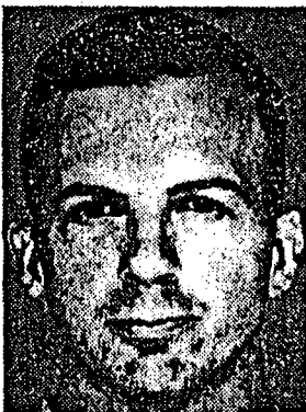
LEE H. OSWALD

And if we weren't there, it just had to be Oswald and two Cubans. Which makes the whole