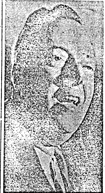
Jim Garrison, New Orleans District Attorney, at a post election celebration.

that Mr. Garrison's primary rights liberal.