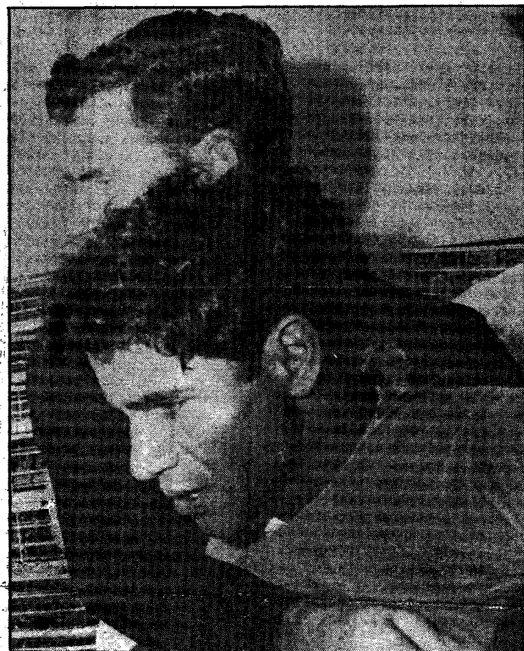
SIRHAN BEING restrained by a guard. So far he has served four years of his life sentence