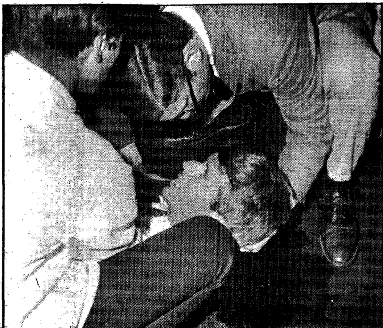
MOMENTS AFTER he was struck down by Sirhan's bullets, Robert Kennedy lies bleeding on the floor

"Our lives will go on being troubled until the truth comes out in Sirhan's case. After that, everything will be all right," he says.