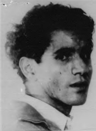
SIRHAN BISHARA SIRHAN, male, Arab, born 3/19/44 Jerusalem, 5'3", 120 #, brown hair, brown eyes