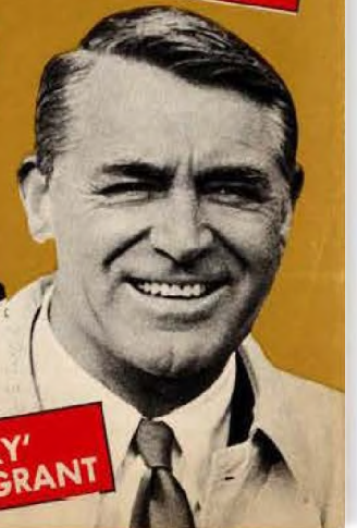
'SEXY' CARY GRANT