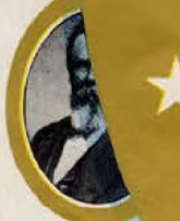
RUTHERFORD B. HAYES