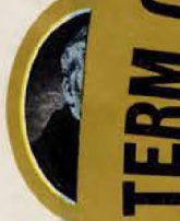
WILLIAM HENRY HARRISON