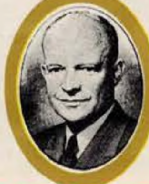
DWIGHT D. EISENHOWER