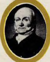
JOHN QUINCY ADAMS