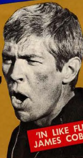
'IN LIKE FLINT' JAMES COBURN