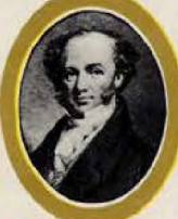
MARTIN VAN BUREN