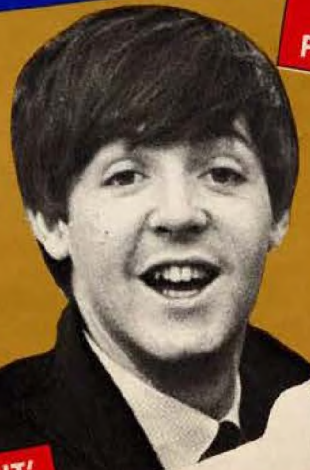
'BEATLE' PAUL McCARTNEY