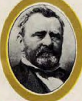
ULYSSES S. GRANT