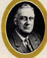
FRANKLIN D. ROOSEVELT