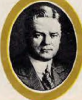
HERBERT C. HOOVER