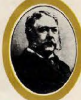
CHESTER A. ARTHUR