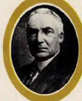
WARREN G. HARDING