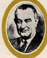
LYNDON B. JOHNSON

THE INSIDE STORY OF HOW BOBBY KENNEDY WILL SUCCEED PRES. JOHNSON