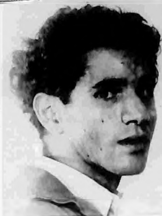
SIRHAN BISHARA SIRHAN, male, Arab, born 3/19/41 Jerusalem, 5'3", 120 #, brown hair, brown eyes