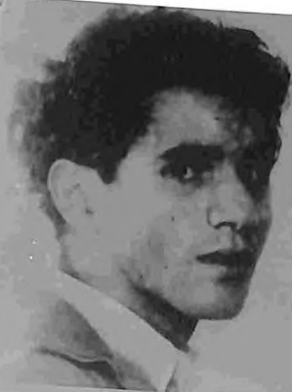
SIRHAN BISHARA SIRHAN, male, Arab, born 3/19/44, Jerusalem, 5'3", 120 #, brown hair, brown eyes