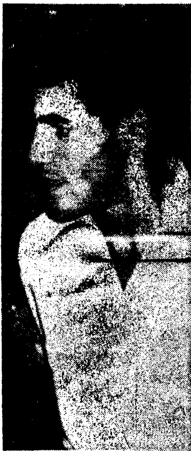
SIRHAN B. SIRHAN ... the suspect