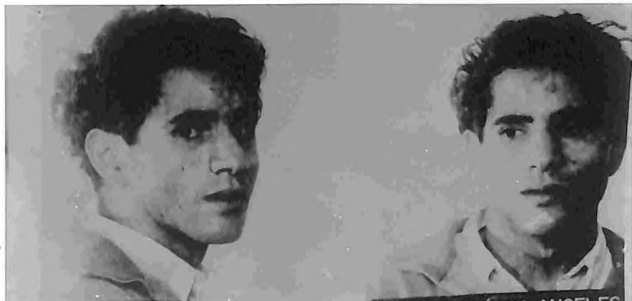
SIRHAN BISHARA SIRHAN, male, Arab, born 3/19/44 Jerusalem, 5'3", 120 #, brown hair, brown eyes