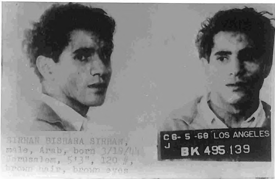
SIRHAN BISHARA SIRHAN, male, Arab, born 3/19/44 Jerusalem, 5'3", 120 #, brown hair, brown eyes