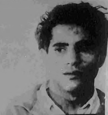
SIRHAN BISHARA SIRHAN, male, Arab, born 3/19/44, Jordanian, 5'3", 120 #, brown hair, brown eyes