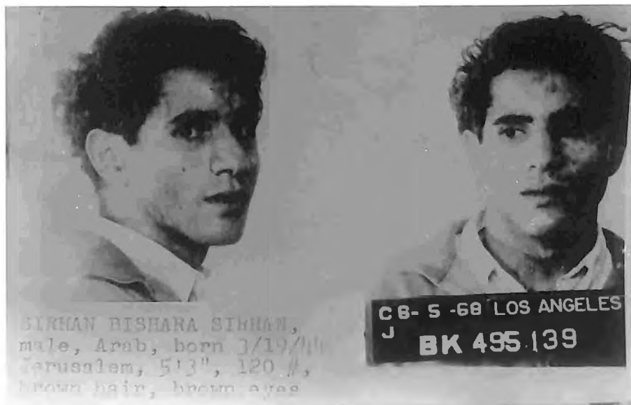
SIRHAN BISHARA SIRHAN, male, Arab, born 3/19/44 Jerusalem, 5'3", 120 #, brown hair, brown eyes