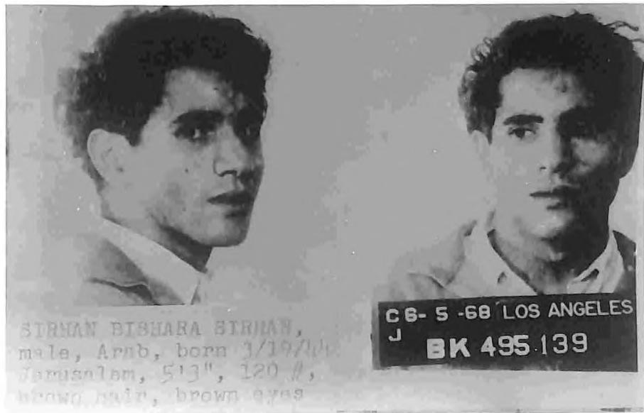
SIRHAN BISHARA SIRHAN, male, Arab, born 3/19/40 Jerusalem, 5'3", 120 #, brown hair, brown eyes