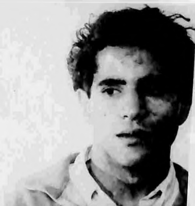
SIRHAN BISHARA SIRHAN, male, Arab, born 3/19/44, Jerusalem, 5'3", 120 #, brown hair, brown eyes