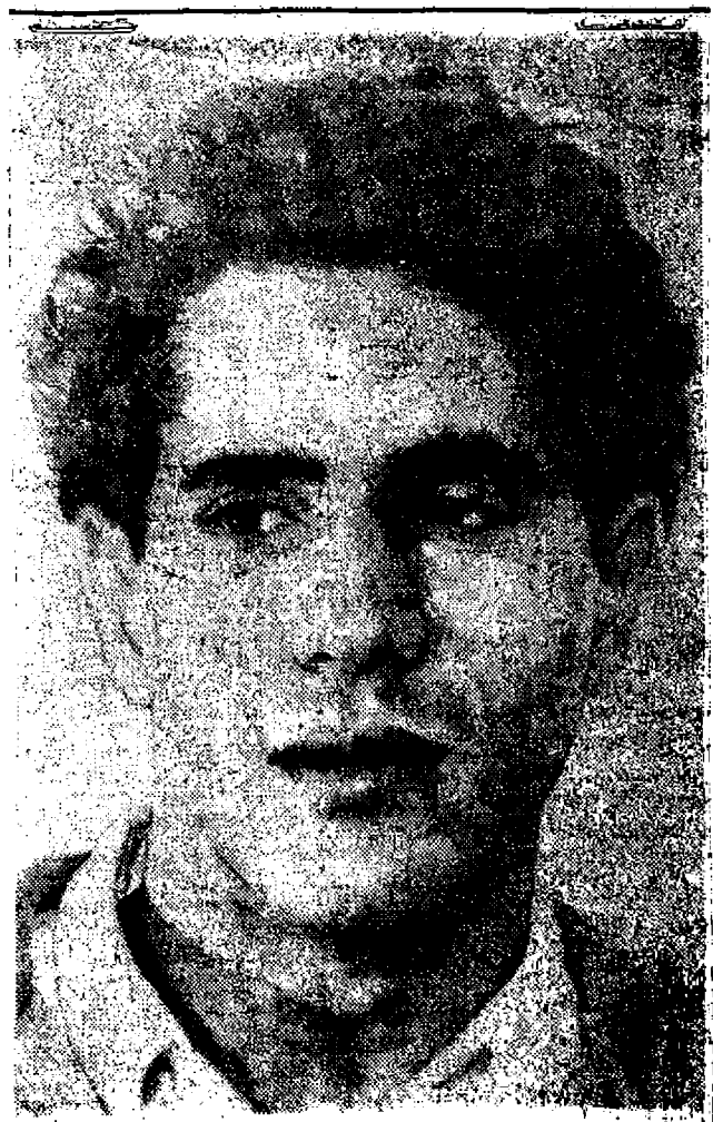
HELD IN ATTACK —Los Angeles police released this picture today of a man they identified as Sirhan Sirhan, 24, who is being held in connection with the shooting of Sen. Robert F. Kennedy early today in Los Angeles.