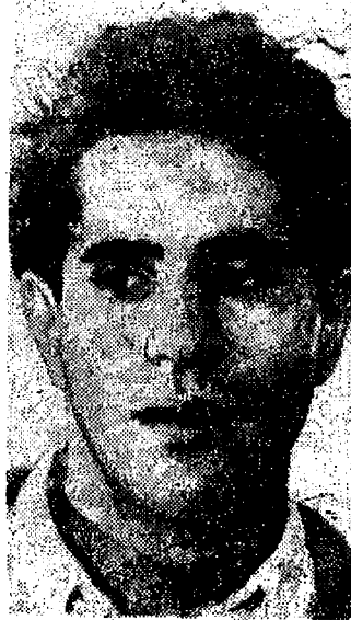
SIRHAN BISHARA SIRHAN ... faces indictment

He predicted that no plea will be made by the defendant during arraignment proceedings. Instead, he said, the defense probably will request a two-week continuance until after a