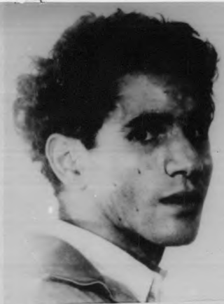
SIRHAN BISHARA SIRHAN, male, Arab, born [REDACTED] Jerusalem, 5'3", 120 #, brown hair, brown eyes