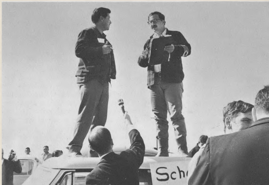
Alinsky-trained Cesar Chavez and S.N.C.C. revolutionary Marshall Ganz harangue for reporters.

Of course, the fact that the pickers didn't want a strike didn't deter the