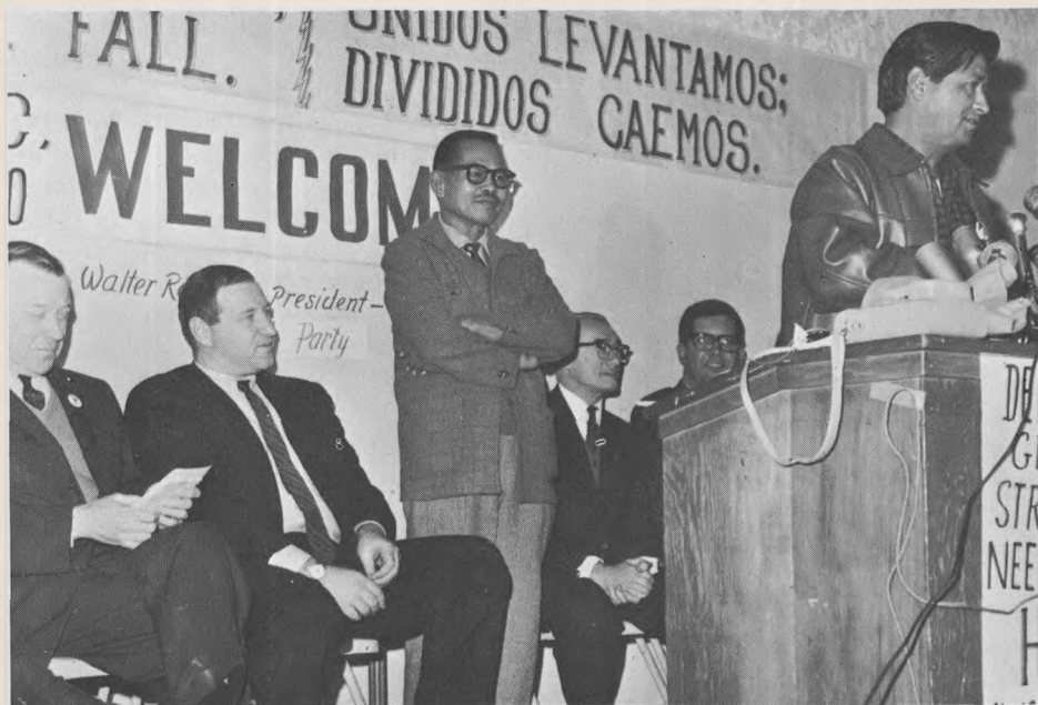
Reuther (L), Communist Itliong (standing), and others listen to Cesar Chavez.