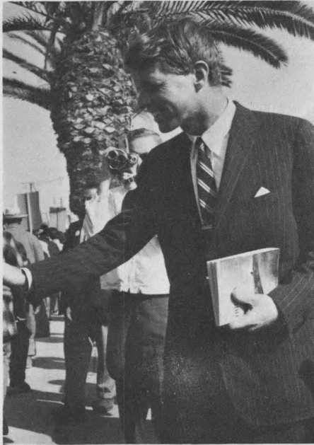
Kennedy encourages Delano revolutionaries.

told us, is for the picketers to shout "We know who you are. If you do not come out on strike now, you won't get a job after we win. Bobby Kennedy is on our side. We can't lose." Another favorite tactic is to fire marbles at the pickers with slingshots — law enforcement authorities report that agitators bought four-thousand marbles in Delano in a single day for use against the field workers. It's not very pretty business; but then, intimidation never is.