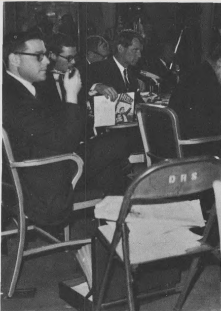
Holding strike book, Kennedy defends Reds.

Another prominent government official who caused a tremendous furor in the Delano area is Senator Robert F. Kennedy, who was in the area in connection with Senate Committee Hearings on agriculture. During the Hearings, when it was brought out that Deputies from the Kern County Sheriff's office were taking candid snapshots of the various agitators and Communists as they entered Delano, Senator Kennedy became very alarmed, much more so than he ever became over the Fair Play For Cuba Committee. "Sheriff," he growled, "I suggest you read the Constitution of the United States." The Senator appears to feel that it is an infringement on the rights of the revolutionaries to have their pictures taken. But Bobby made his point. Representatives from the Sheriff's office do not photograph the Communists in Delano anymore.