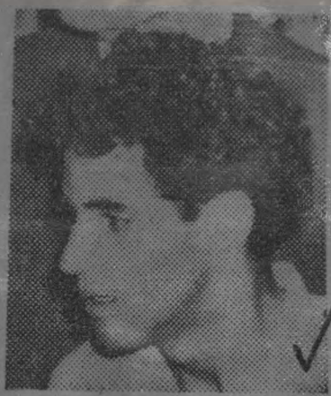
SIRHAN B. SIRHAN

of court — represent- st prominent applica- y standards that have out of a series of cisions, particularly Warren Commission's of official behavior President John F. assassination in