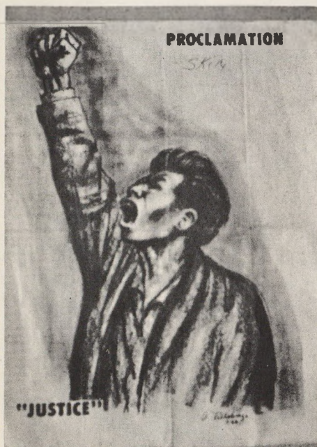
Communist propaganda in Delano.