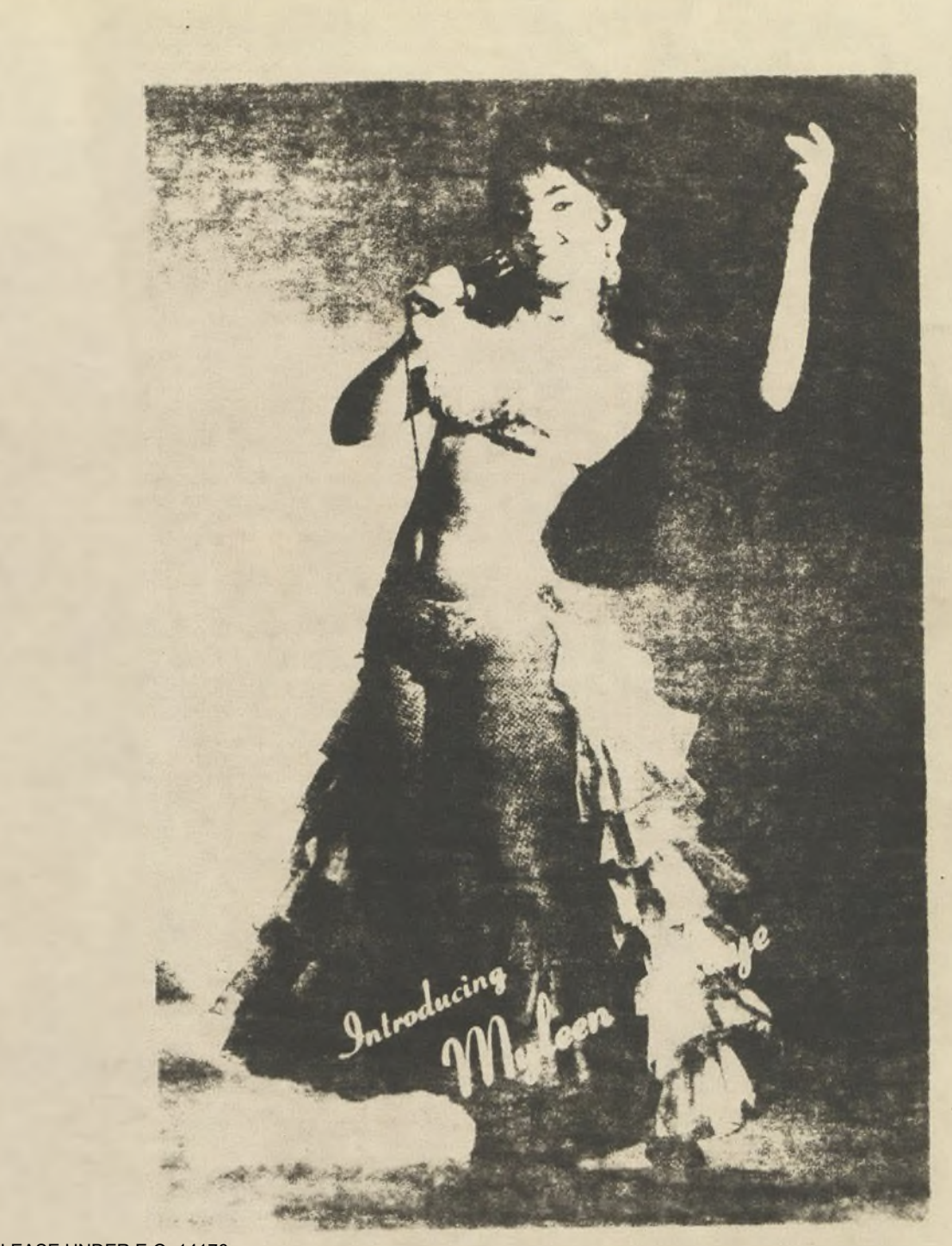
2025 RELEASE UNDER E.O. 14176