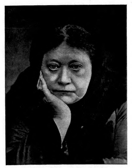
HELENA PETROVNA BLAVATSKY