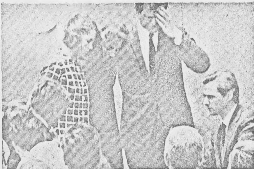
Left (from top): Grieving wife Ethel Kennedy supported by brother Senator Edward Kennedy at Los Angeles airport looking at the casket containing the body of Robert Kennedy before it was lifted into a Presidential jetliner bound for New York. The casket is carried into St. Patrick's Cathedral. Among the pallbearers are two of Robert Kennedy's sons and Senator Edward Kennedy. Edward Kennedy pays a tribute to his assassinated brother at the mass at St. Patrick's Cathedral.