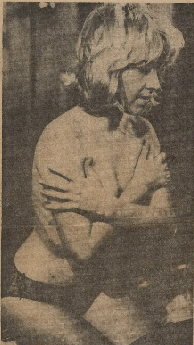
Uninhibited housewife prepares to seduce local college boy.

A New York film producer has portrayed on film what few people have confessed to in private — wife swapping can be fun—and tragic!