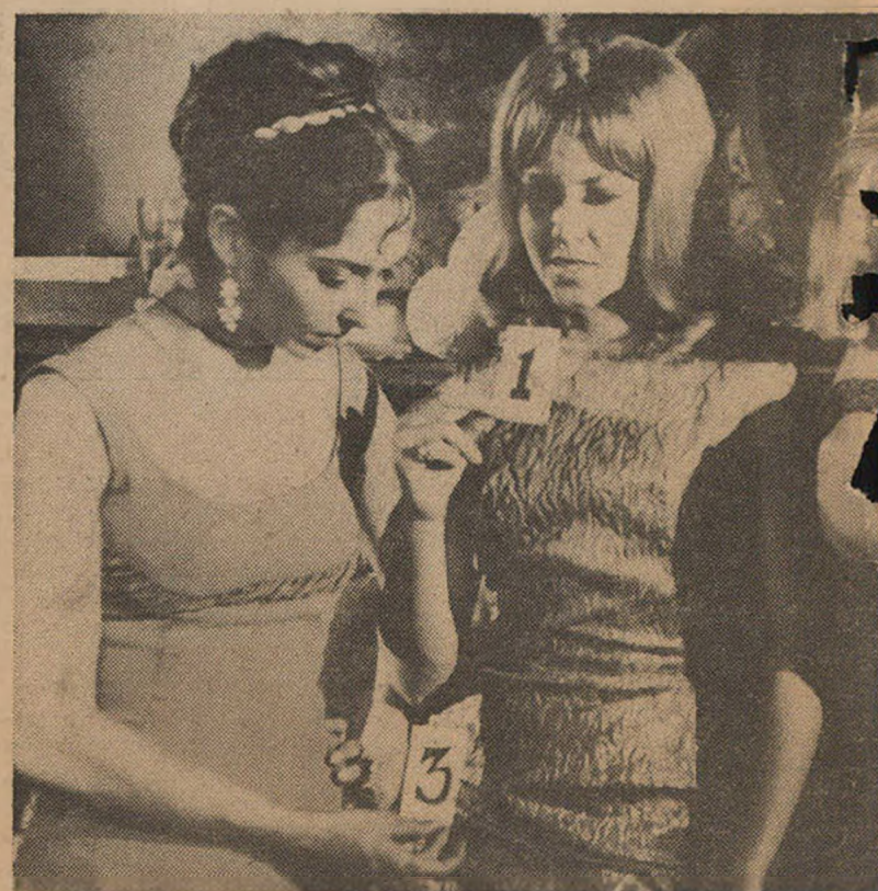
Young suburban wives draw numbers to determine whom club whose activities are vividly

Uninhibited Karen seduces a local college boy. Mona, who agrees reluctantly at first, has an affair with a neighbor, Brooke Furman. From there they are drawn into the local