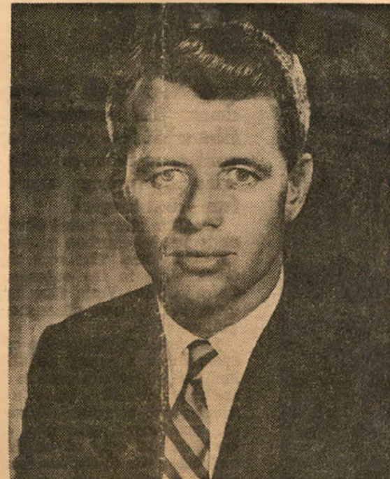
Bobby Kennedy's family fears that the late President's brother will some day come face-to-face with his own Oswald.

"I question whether or not he has a single friend, and I question whether or not his associates are other than people who