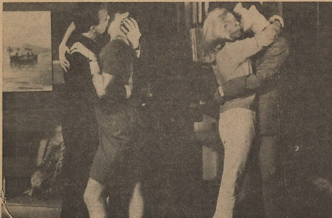
Wife-swap clubs attract frustrated suburban wives, fun-seeking males. Age is no barrier—either way! In some communities, almost all adults participate!

Chemicals must be added to each can of food you buy to